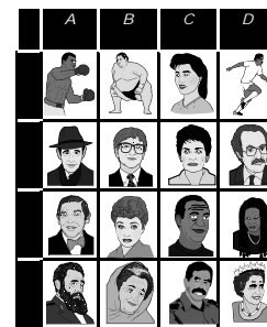
A Learner-Created Famous-People Bingo Board